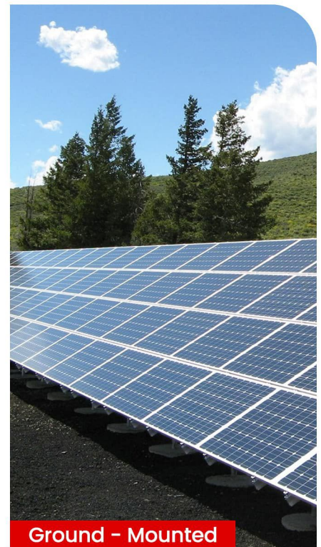
Ground - Mounted

Investors looking for secure & long term investment can prefer this type of model. Here, the units generated from solar system are directly purchased by government DISCOMs. These projects come with 25 years of contract life.